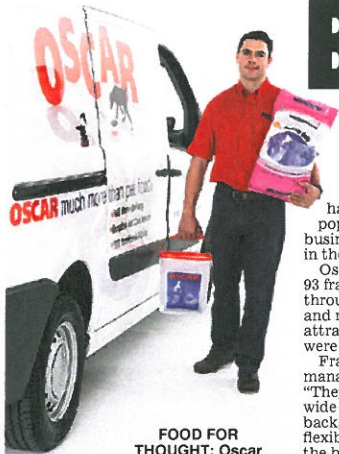
FOOD FOR THOUGHT: Oscar offers flexibility and independence